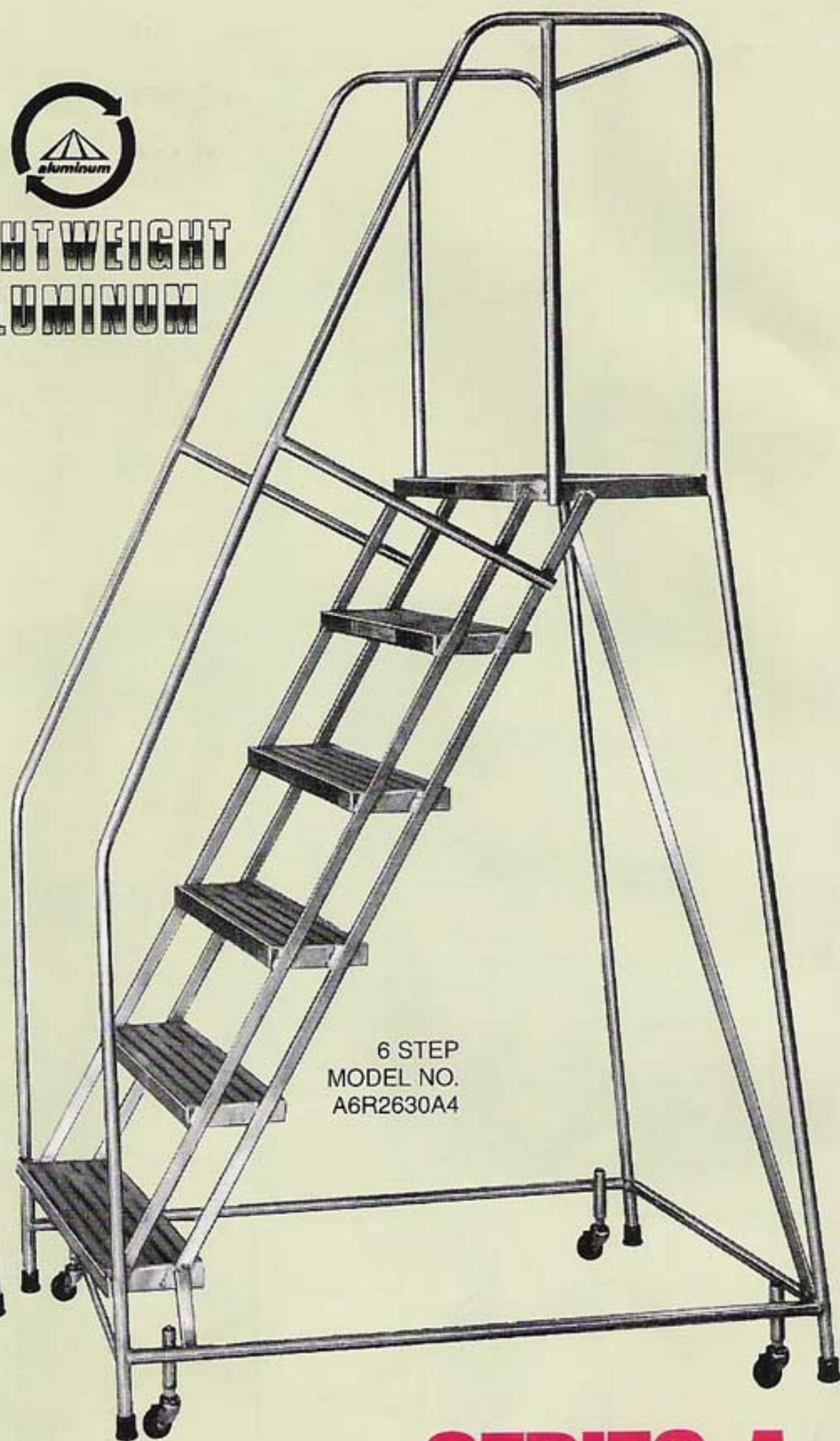
6 STEP MODEL NO. A6R2630A4