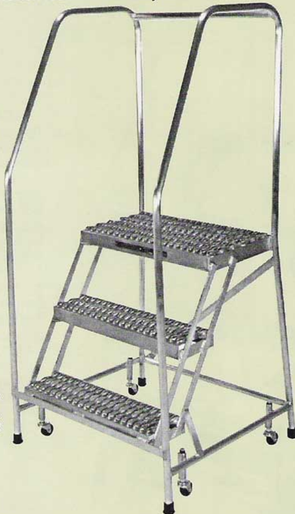
3 STEP MODEL NO. A3R2630A3